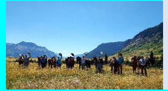
People and Horses June Jansen