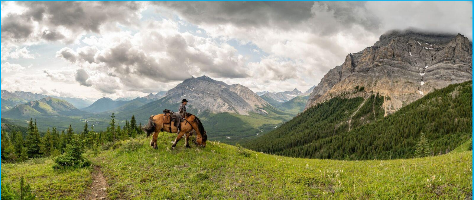
Mountain and Valley Views