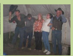
Skit night laughs

Check www.trailridevacations.com for even more great pics and details