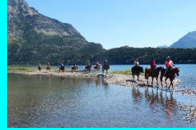
On the Trail Jude Fleetham