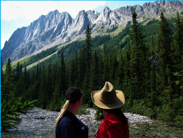
Lunch Break by a beauty of a Creek