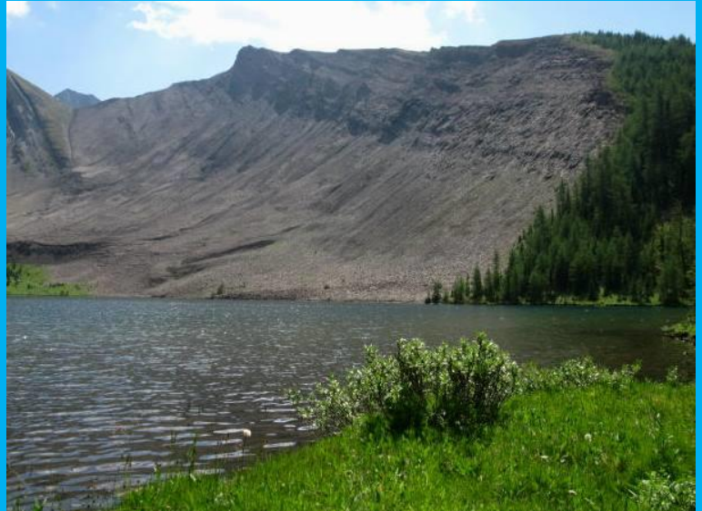
Lunch by a Lake – Hiked to the top, Swam, Fished