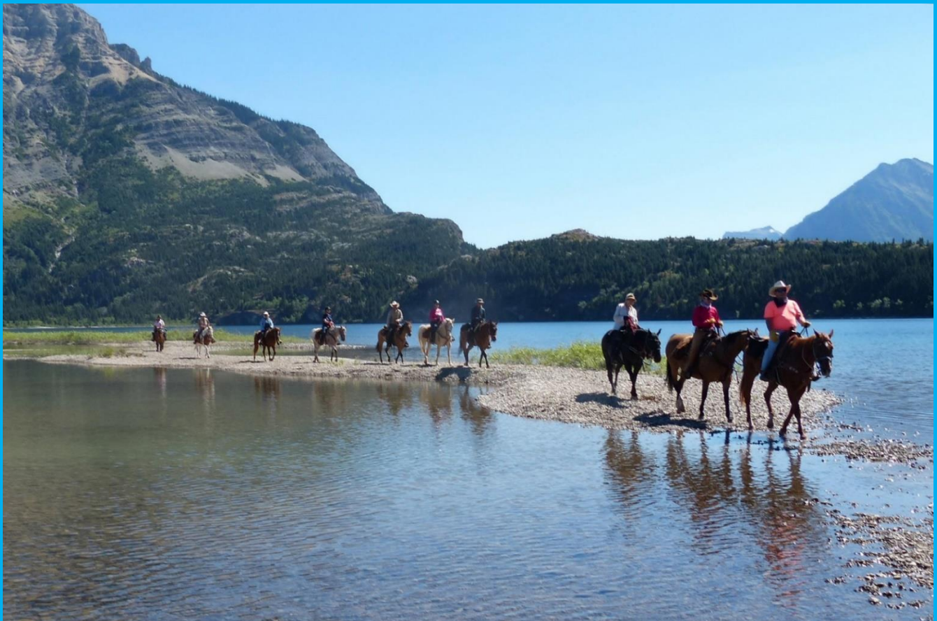
1 st On The Trail by Jude Fleetham