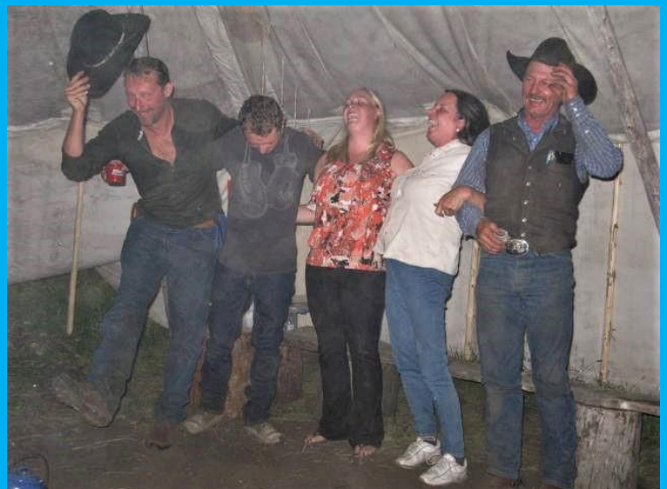
Skit night fun with the Staff