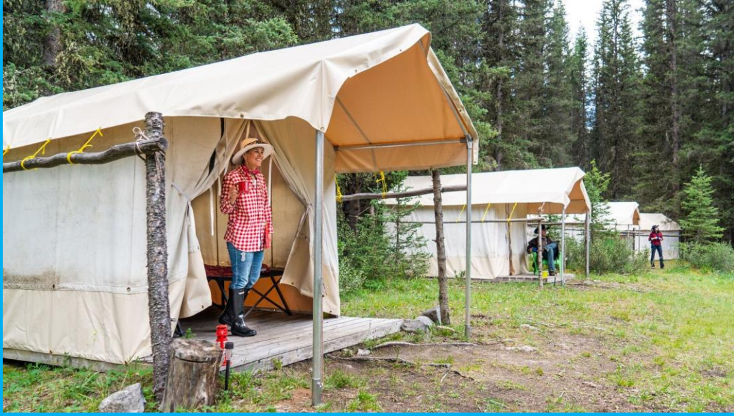
Camp Tents / Platforms