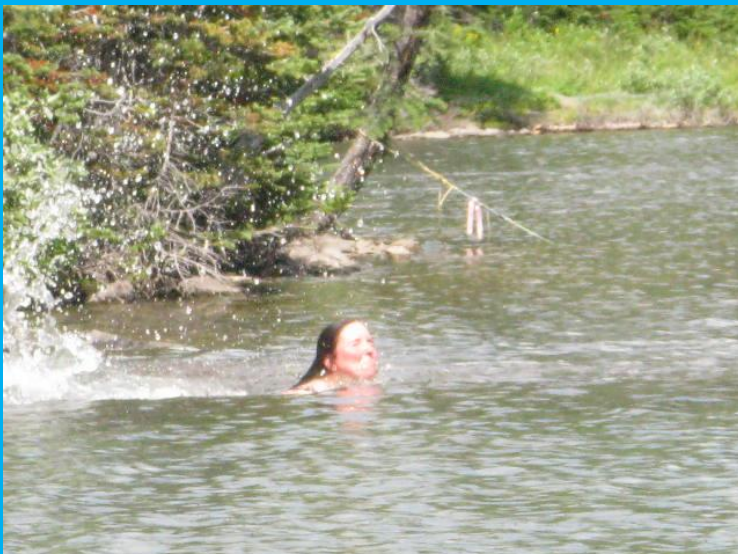
Some Swam, others fished, others hiked, some slept