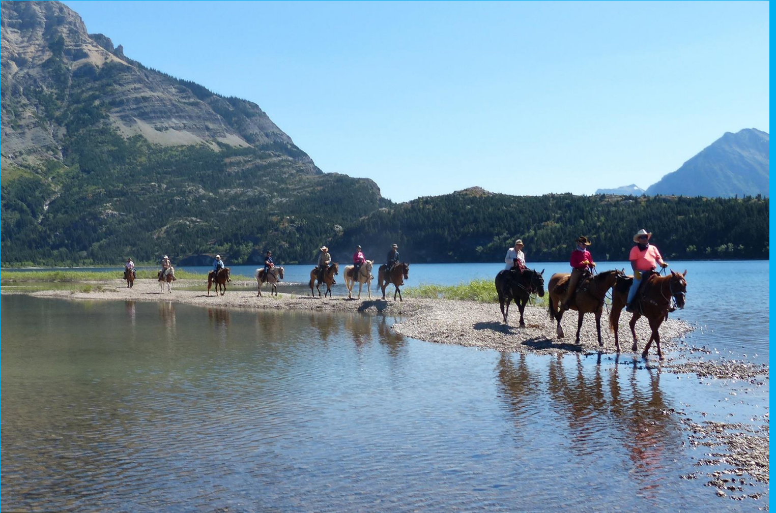
1 st On The Trail by Jude Fleetham