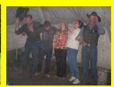
Skit night laughs

Check www.trailridevacations.com for even more great pics and details but here's a short description. During our 6 day backcountry rides we will visit two awesome permanent BTR camp sites with wall tents on wood platforms (with raised beds/thermarest mattress's) and large heated kitchen/dining tents (No Teepees in camp this year).