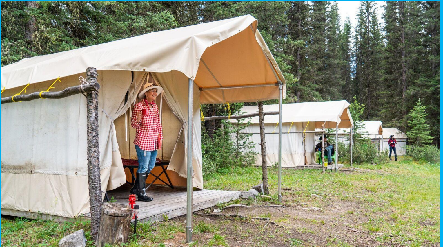
Cascade Camp Tents / Platforms