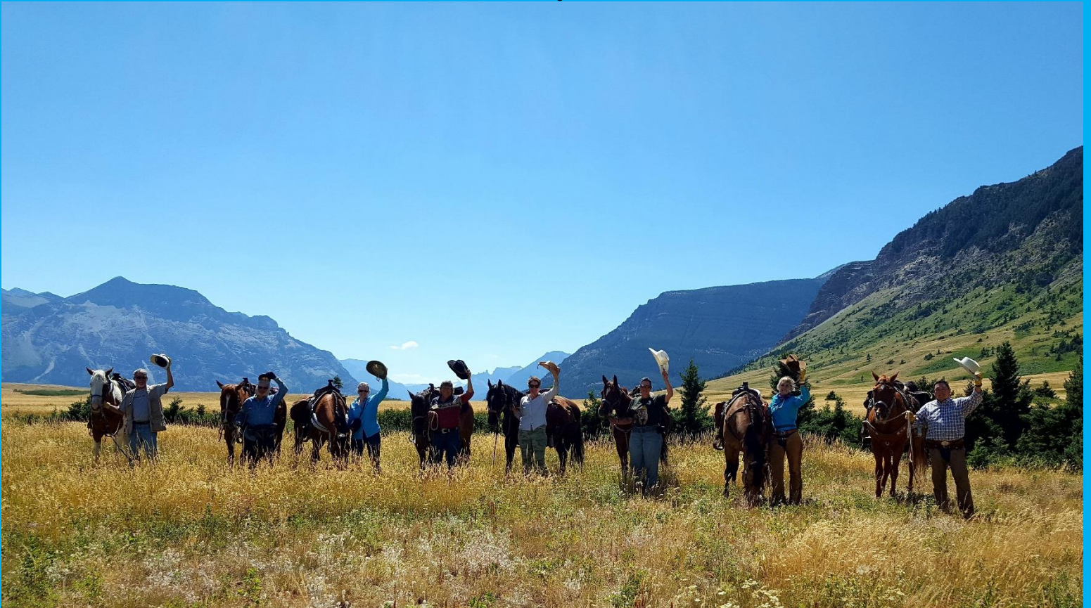
1 st People and Horses by June Janson