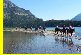
On the Trail Jude Fleetham