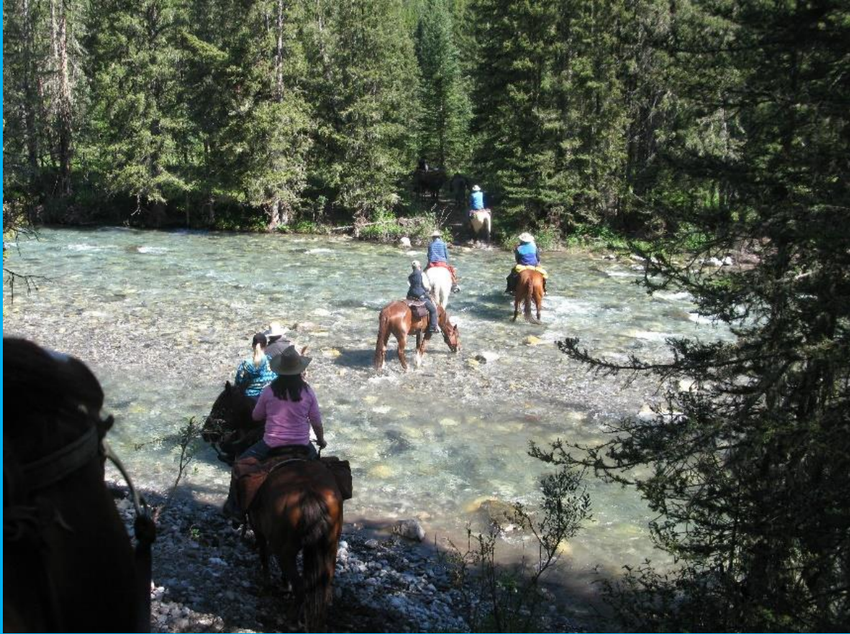
River and Creek Crossings