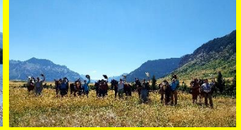
People and Horses June Jansen