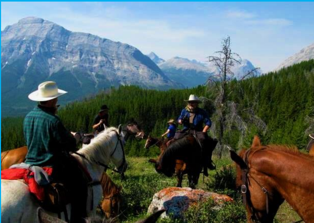
Riding Ridges & seeing Valleys below & Towering Rockies