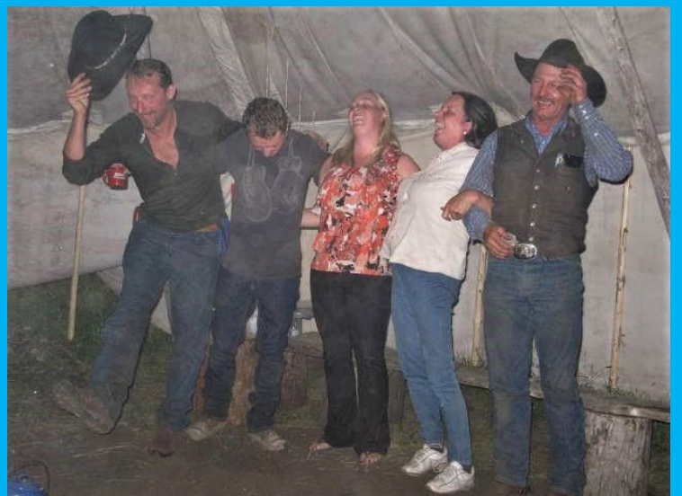
Skit night fun with the Staff