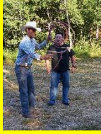
Camp J. Fleetham