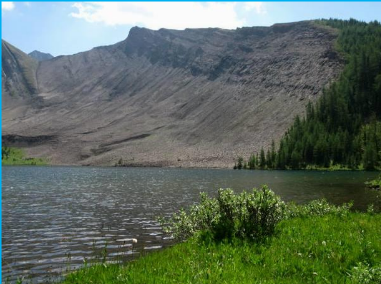
Lunch by a Lake - Hiked to the top, Swam, Fished