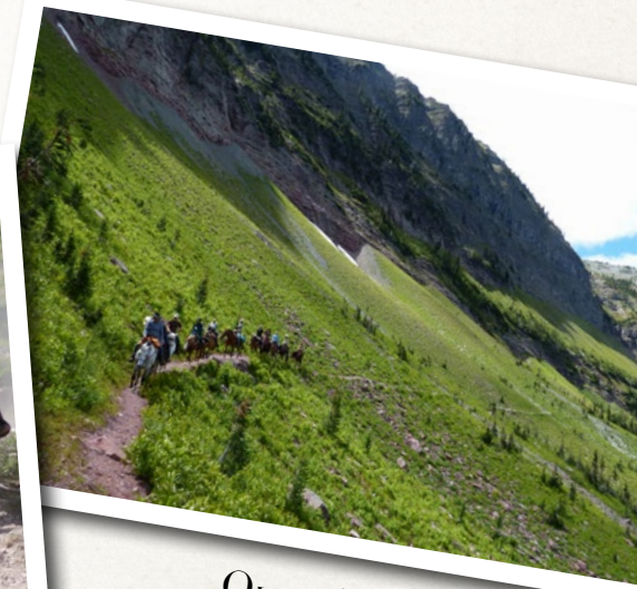
Over the Pass