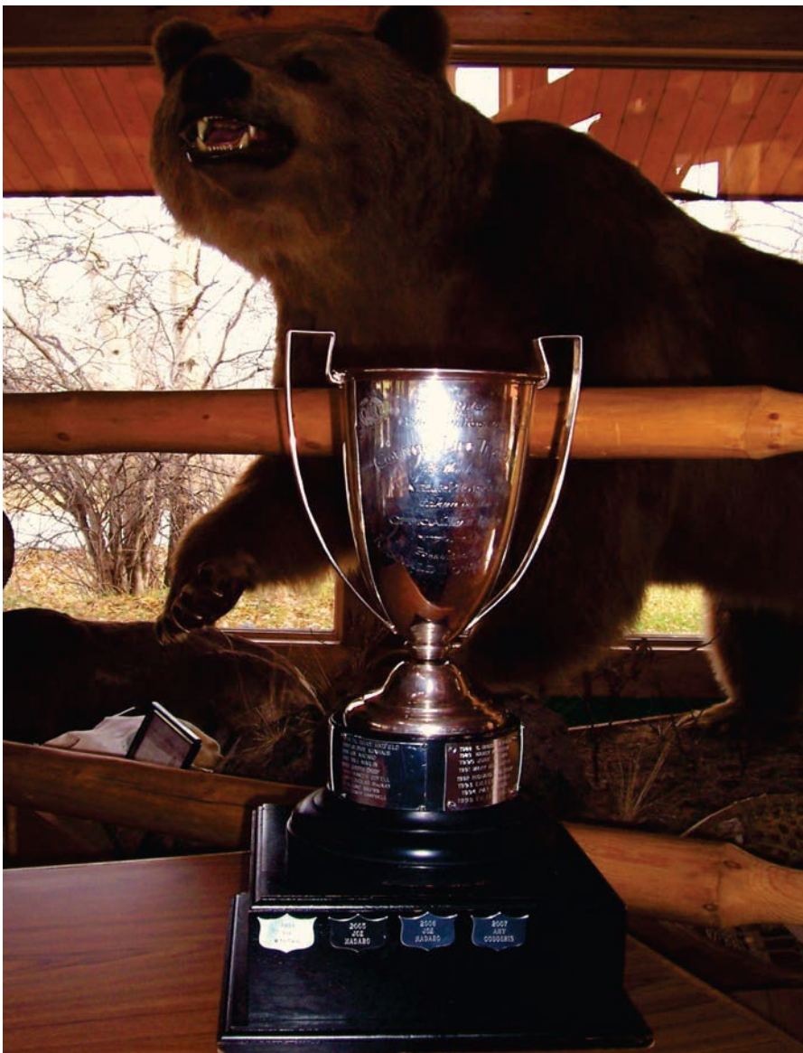
The Townsend Trophy