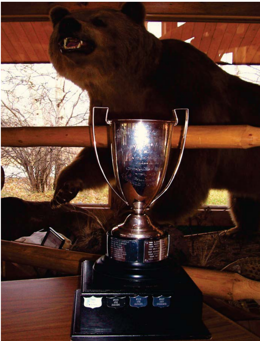
The Townsend Trophy